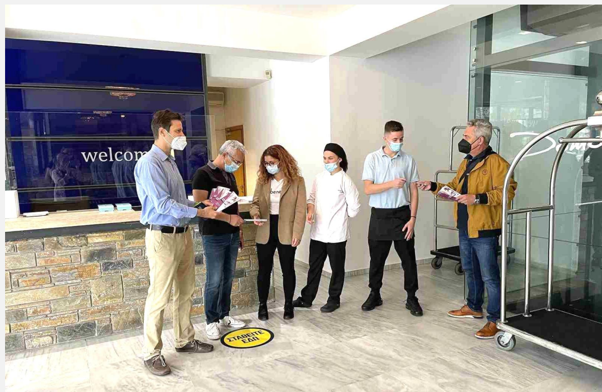
Photo: Hellenic labour inspectorate informing HORECA workers of their rights as part of the Rights for All Seasons campaign.

The COVID pandemic has had an impact on the labour market which has led to new forms of undeclared work. Cooperation and collaboration between Platform members and observers are important to ensure sharing of information and exchange of good practices on a national and EU level. The latest Platform newsletter highlights some of the collaboration undertaken by the Platform, including EU wide campaigns and developing approaches of cooperation between labour inspectorates and social partners.