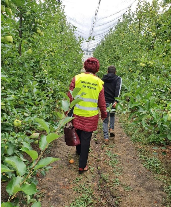
Photo: Romanian Labour Inspectorate during inspection